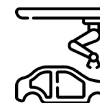
Auto & Aerospace Manufacturing