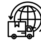
Electric Supply Chain